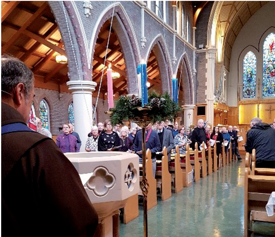
Lighting the Advent candles at St. John the Divine, Victoria.