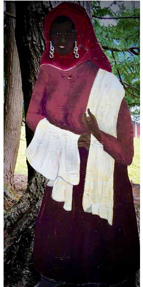
The innkeeper.