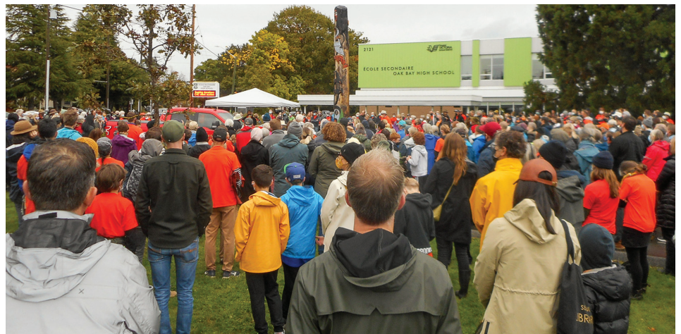
Oak Bay community members gather in front of the Sno’uyuth Welcome Pole to honour residential school survivors and their families.