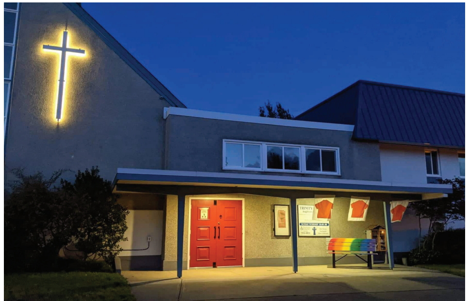
Orange t-shirt flags hanging outside Trinity, Port Alberni.

Many churches will be displaying their messages of support and orange T-shirts long after September 30, and indeed, the work of truth and reconciliation continues. ■