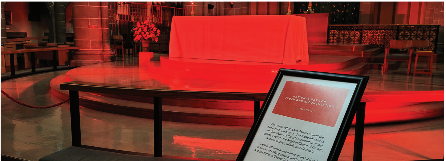
The altar at Christ Church Cathedral bathed in orange light with an orange floral display.