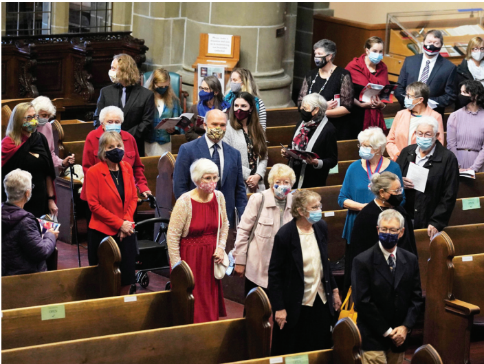
Honorees file into the cathedral.