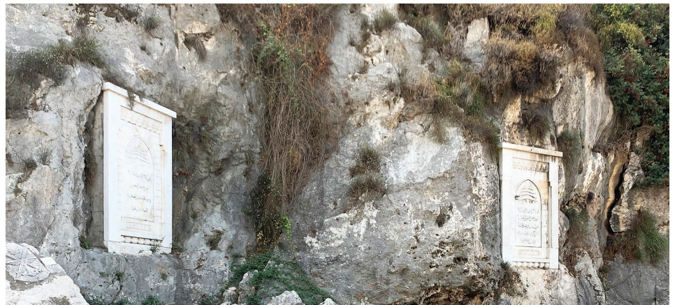
Commemorative stelae of Nahr el-Kalb.

What Maundrell discovered when he and a few companions explored that path is today on the UNESCO Memory of the