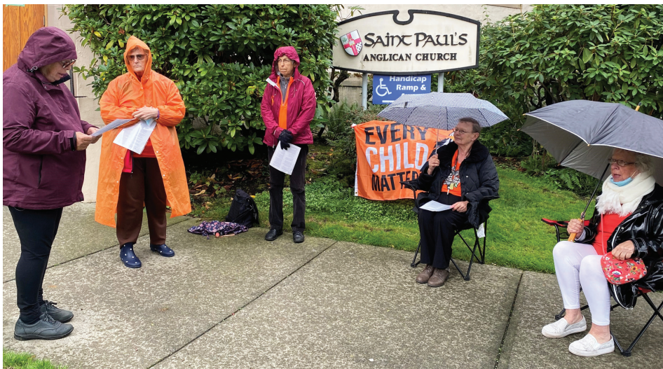
Church members and passers-by gather outside St. Paul, Nanaimo, to read and listen to the 94 calls to action of the Truth and Reconciliation Commission.