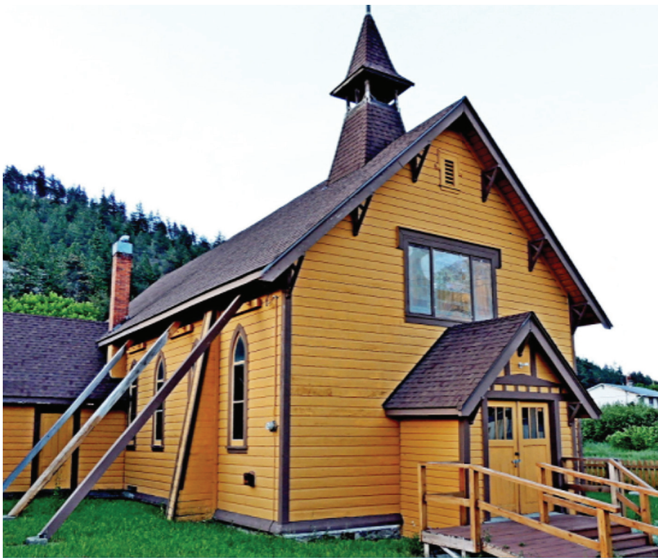
St. Mary and St. Paul Anglican Church, located on Lytton First Nation land, was totally destroyed in the fire.