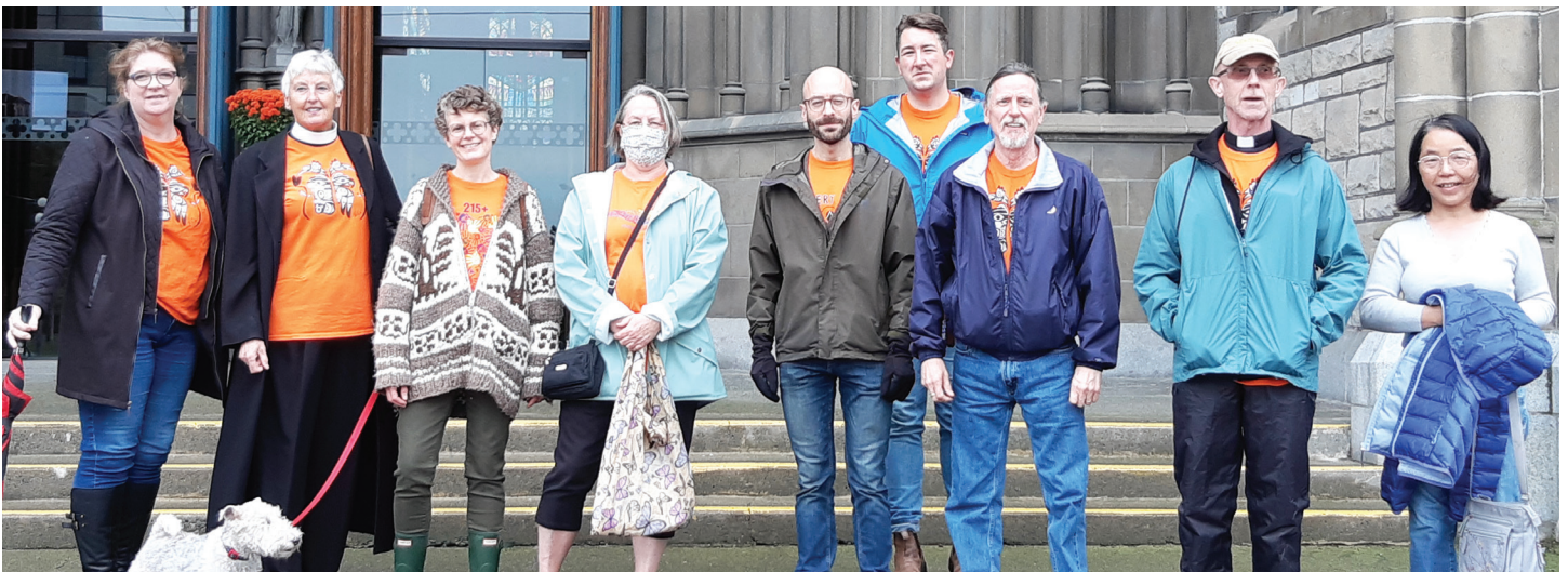
A group gathered outside Christ Church Cathedral to walk together to Centennial Square for the Every Child Matters ceremony.