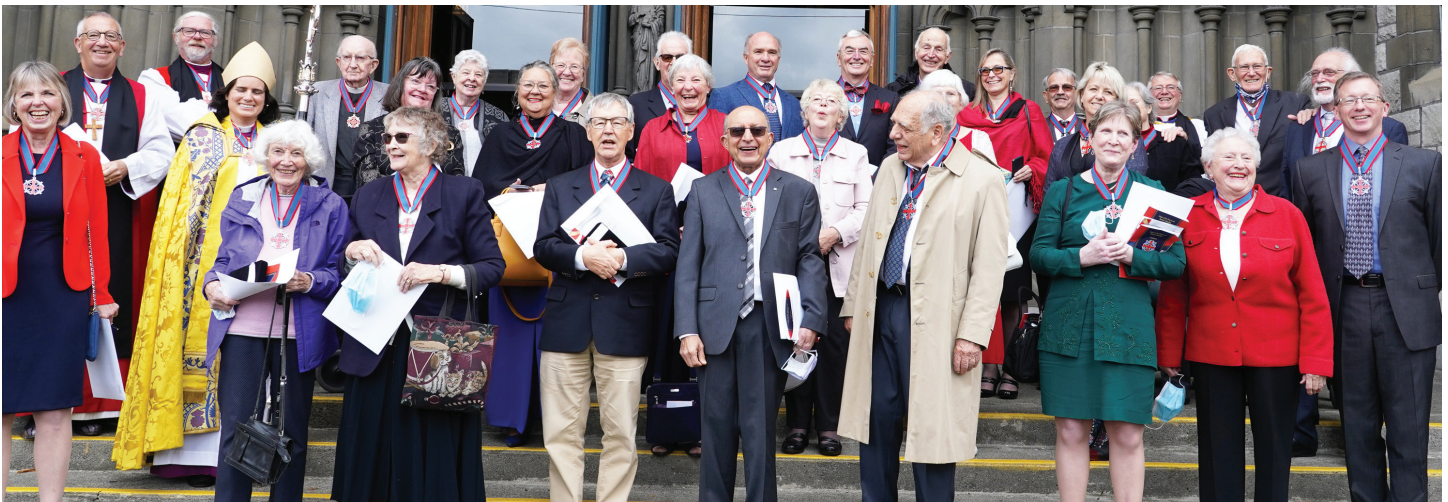
Order of the Diocese of British Columbia honorees on the steps of the cathedral following the investiture service.