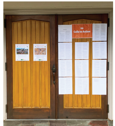
The 94 calls to action posted on the doors of St. Mary, Oak Bay.