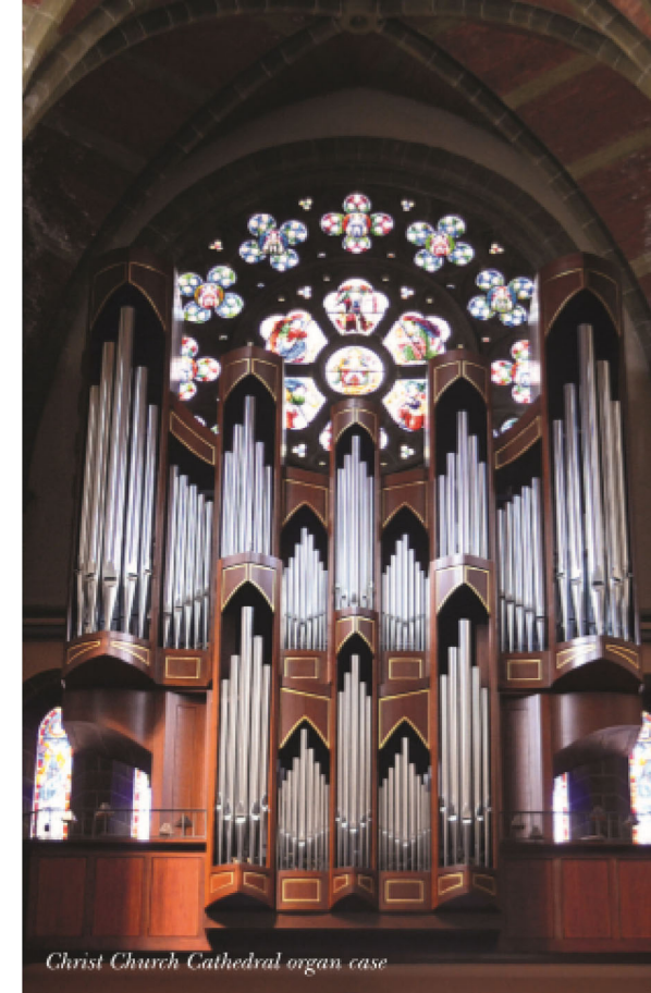
Christ Church Cathedral organ case

Larkin also acknowledges that "the administration aspect of a cathedral type of choir is substantial" which is further challenged by a diminishing volunteer base of parents who are less likely to have sung in a church choir themselves and are therefore generally less motivated to enrol their children in one.