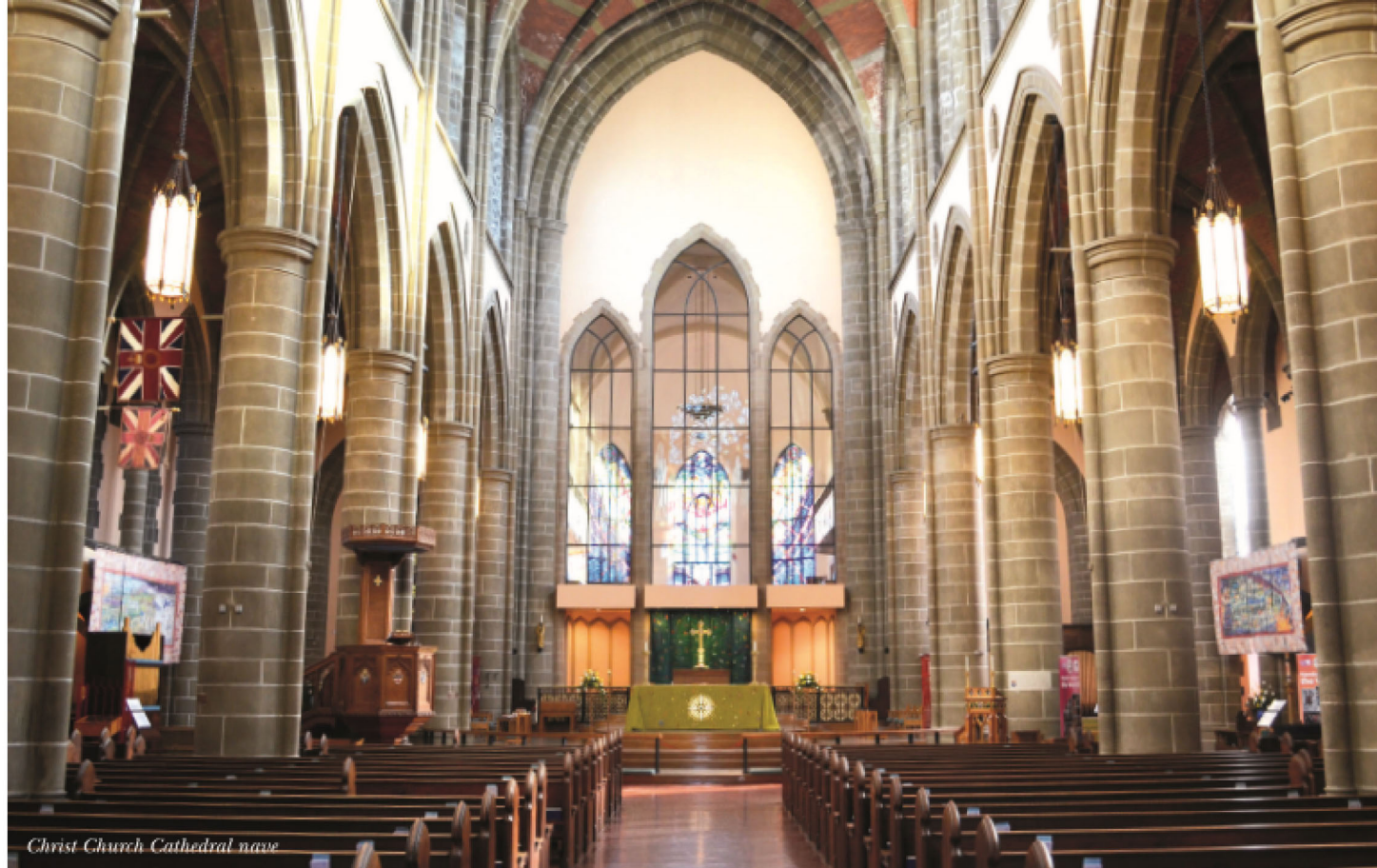
Christ Church Cathedral nave

"There is a regeneration of Choral Evensong [in England], with cathedral congregations rising during the week, despite a decline on Sundays."